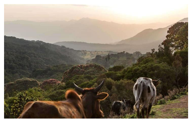
Land use and land use changes are the primary drivers of biodiversity loss in agriculture based livelihood system. Harenna forest.

Ethiopia is one of the top 25 biodiversity-rich countries in the world, and hosts two of the world's 36 biodiversity hotspots, the Eastern Afromontane and the Horn of Africa hotspots (Ethiopia EBI Ecosystem Assessment 2021). This incredible richness offers invaluable ecosystem goods and services that benefit human population and their well-being.